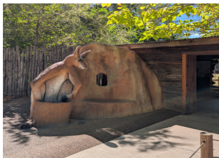
The New Australia Exhibit