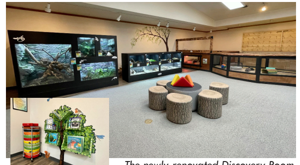
The newly-renovated Discovery Room.