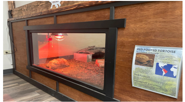
Hercules enjoying his expanded enclosure.

The space also provides cozy spots for children to do crafts, gather around a "cozy fireplace" on faux log stools, or curl up in a ploof to read. This fun, innovative furniture was provided by Fomcore, a new local company brought to Pueblo by Pedco. Rampart Tile & Nora provided flooring made with sustainable products. We are so excited to re-open this space. With different themes, presentations, crafts and animal activity, this will be a great place for our guests to visit time and time again. We can't wait to see all the discovery, learning and energy return to this room. We could not have done it without the help of our partners in designing and building these unique components that serve both our animals and our guests.