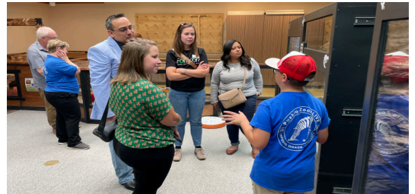
A ZooALIVE member educates visitors at the ribbon-cutting.